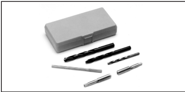
Fig. 1 Cleaning Tool Kit Contents

The transducer Mounting Hole Machining Tool Kit contains all the necessary drills and taps to prepare a standard 1/2-20 UNF transducer mounting hole. The kit contains the special pilot drill required to machine the 45° seat. All tools included in this kit are made of premium grade strength tool steel. Care should be taken in the use of proper speeds and feeds, lubricants, and a method to assure continual alignment of each progressing tool. Consult Dynisco for additional information. M10 and M18 machining kits are also available.