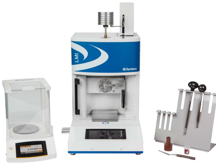
SHOWN WITH ALL AVAILABLE OPTIONS

THE MOST ACCURATE MELT FLOW INDEXER WORLDWIDE