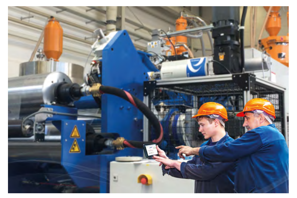
Correlate your rheological data from the lab to the production floor.