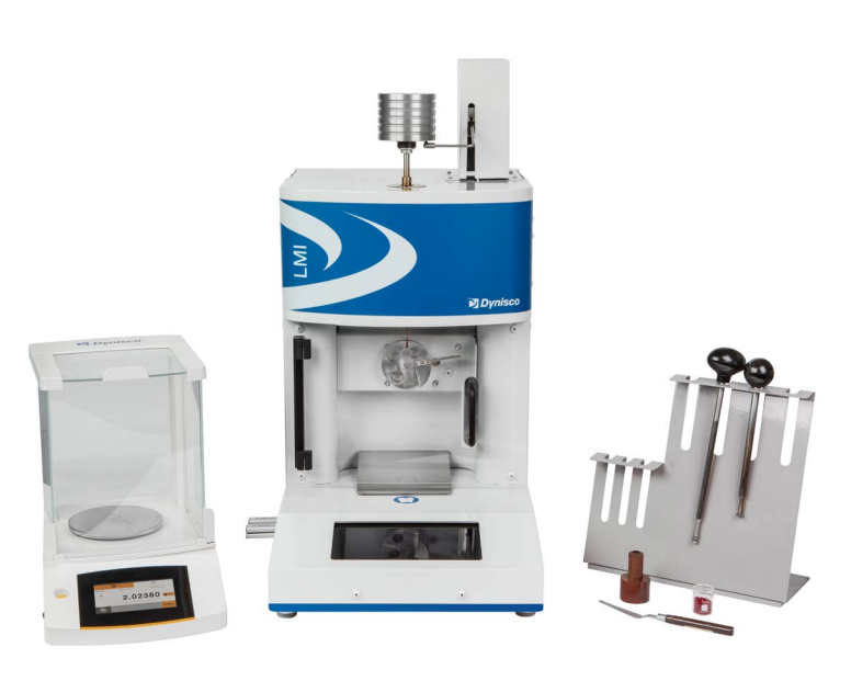
SHOWN WITH ALL AVAILABLE OPTIONS

THE MOST ACCURATE MELT FLOW INDEXER WORLDWIDE